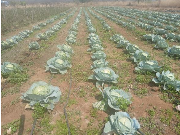
Figure 1 - Cabbage ready for market